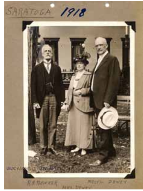
R.R. Bowker, left, with Melvil Dewey, right, developer of the Dewey Decimal System, and Dewey's wife.